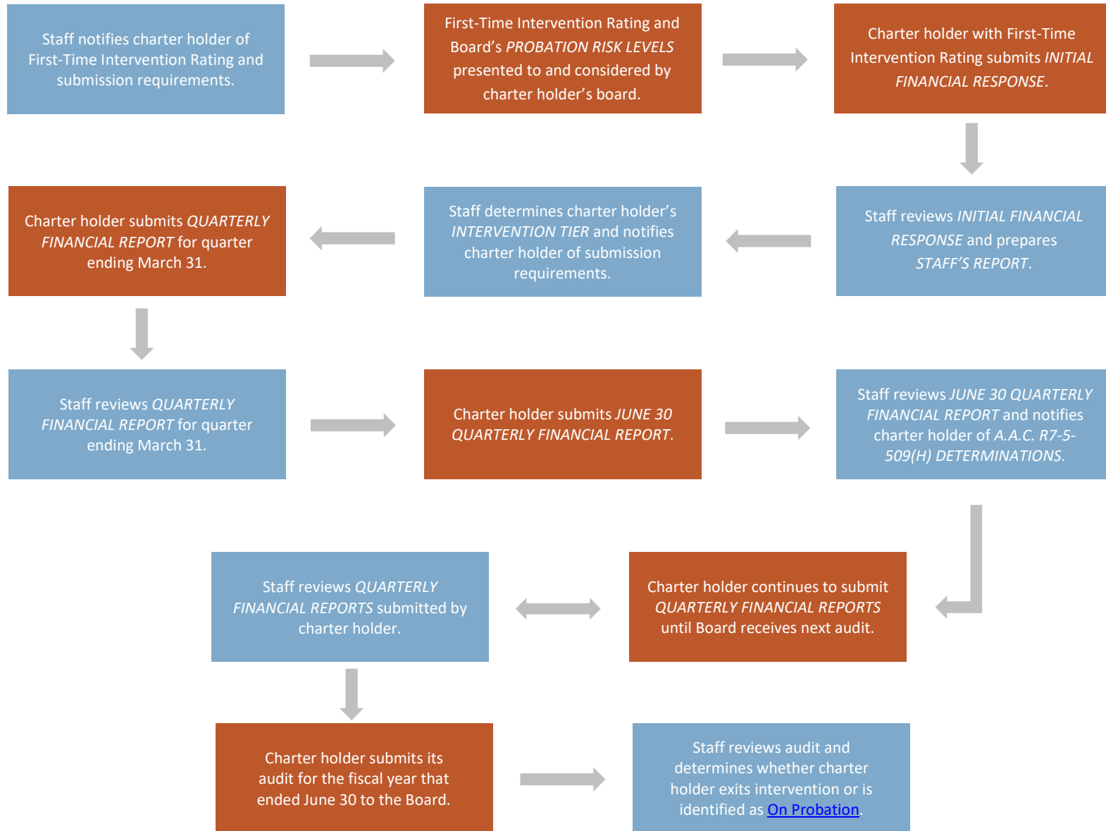
Figure 1: "First-Time" Intervention Process Overview